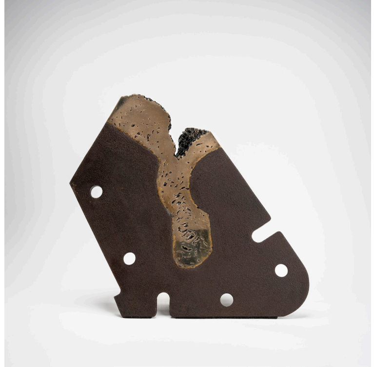
Fragment No. 7 Weathering steel, mild steel, silicon bronze. 17.7 x 4.9 x 16.3". 1/1. 2024.