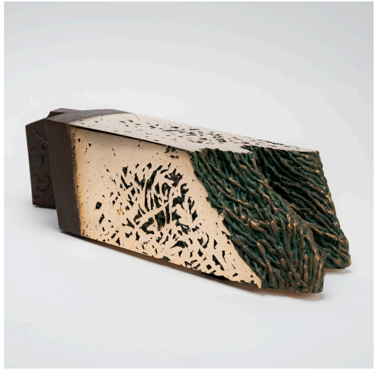
Fragment No. 9 Weathering steel, mild steel, silicon bronze. 15.7 x 4.3 x 3.9". 1/1. 2024.