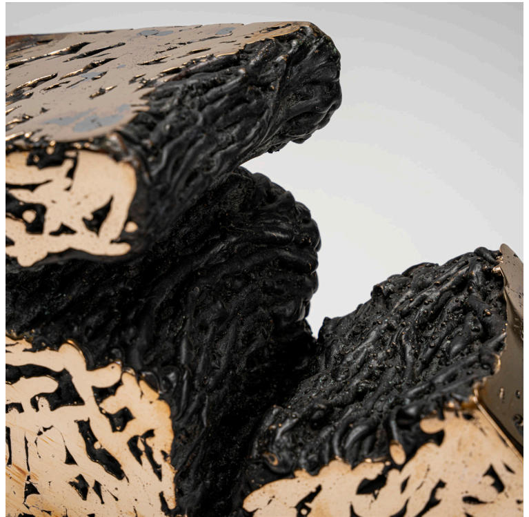
Fragment No. 4 Weathering steel, mild steel, silicon bronze. 10.2 x 3.5 x 6.5". 1/1. 2024.