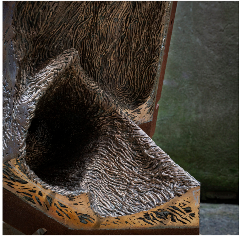
Fragment No. 2 Weathering steel, mild steel, silicon bronze. 25.5 x 37.4 x 36.2". 1/1. 2024.