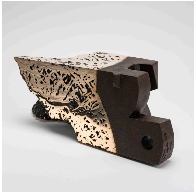
Fragment No. 10 Weathering steel, mild steel, silicon bronze. 15.5 x 5.9 x 6.1". 1/1. 2024.