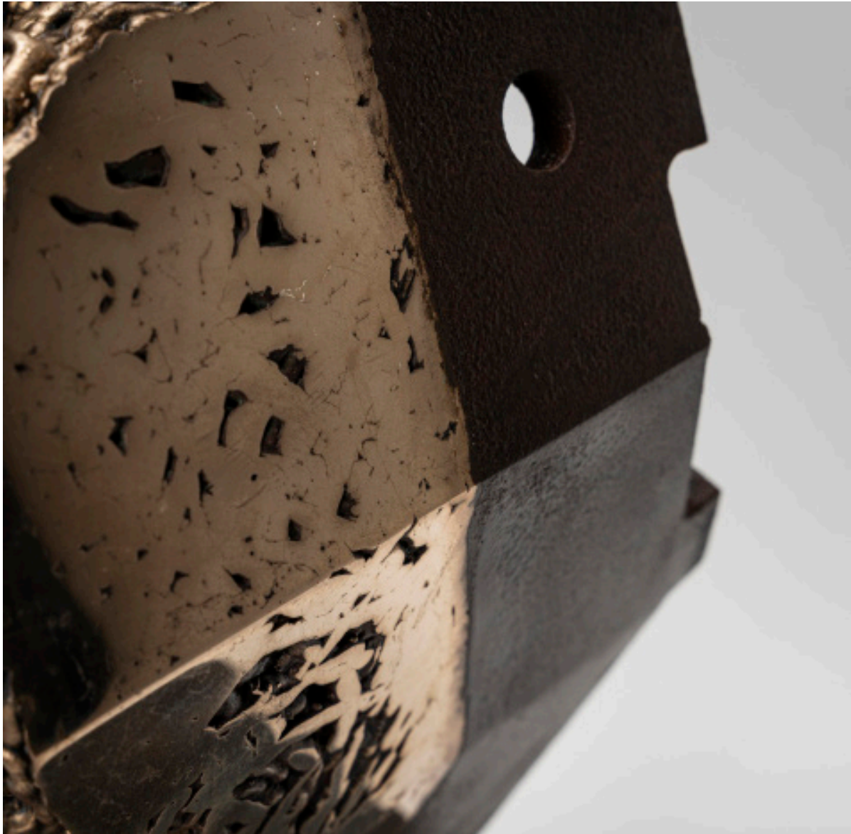
Fragment No. 3 Weathering steel, mild steel, silicon bronze. 10.2 x 3.5 x 6.5". 1/1. 2024.