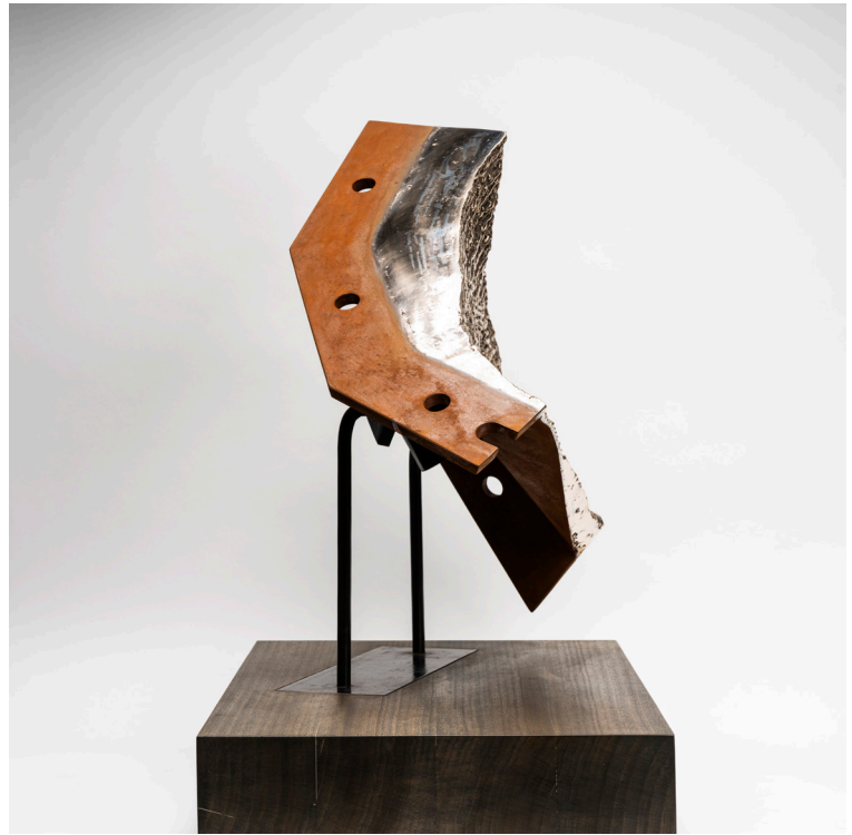
Fragment No. 1 Weathering steel, mild steel, silicon bronze. 16.5 x 5.9 x 20.4". 1/1. 2024.