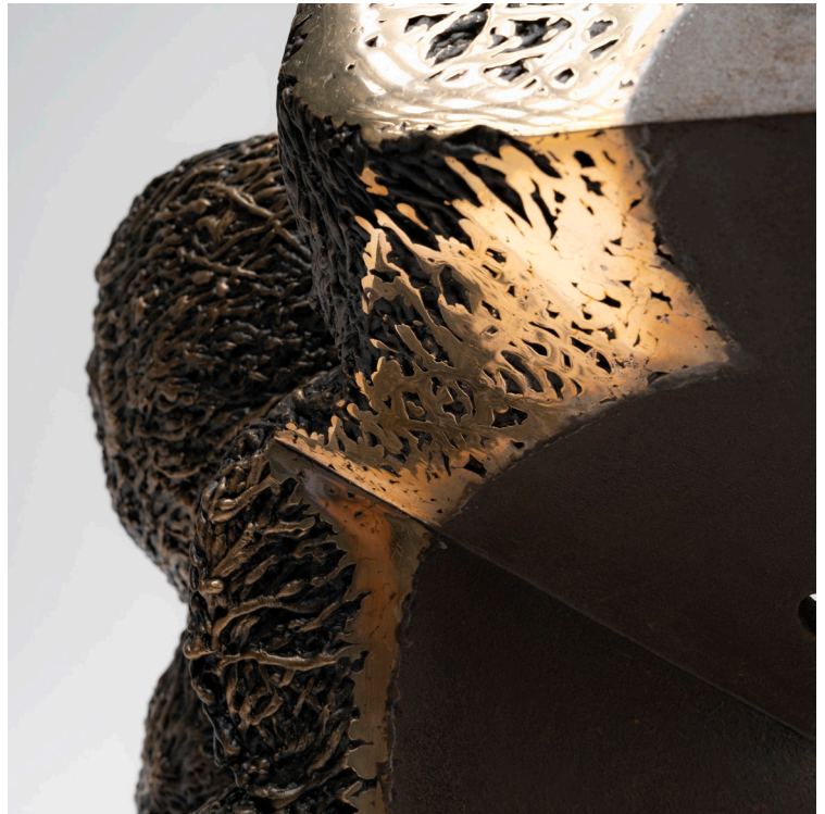
Fragment No. 8 Weathering steel, mild steel, silicon bronze. 14.9 x 8.6 x 21.6". 1/1. 2024.