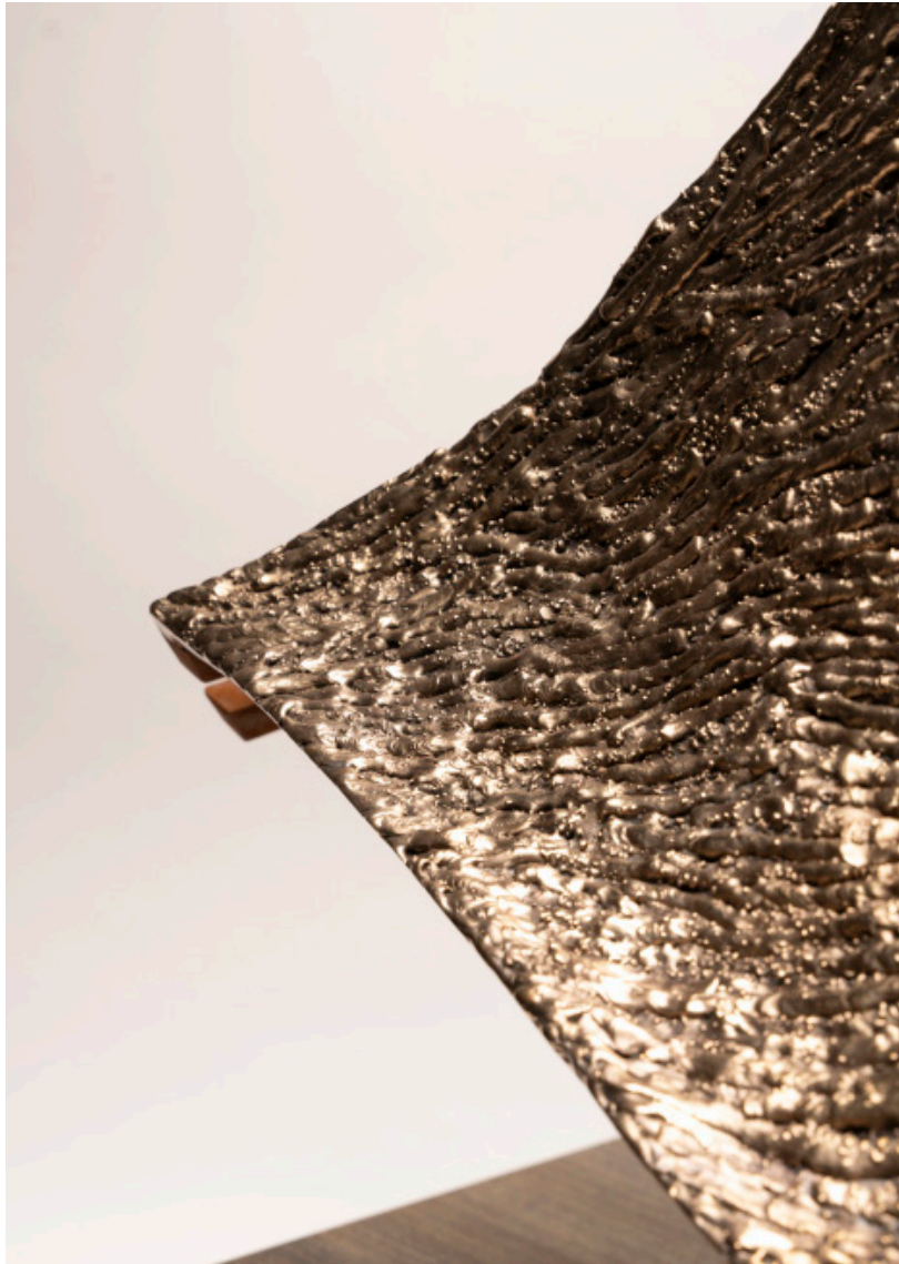
Fragment No. 1 Weathering steel, mild steel, silicon bronze. 16.5 x 5.9 x 20.4". 1/1. 2024.