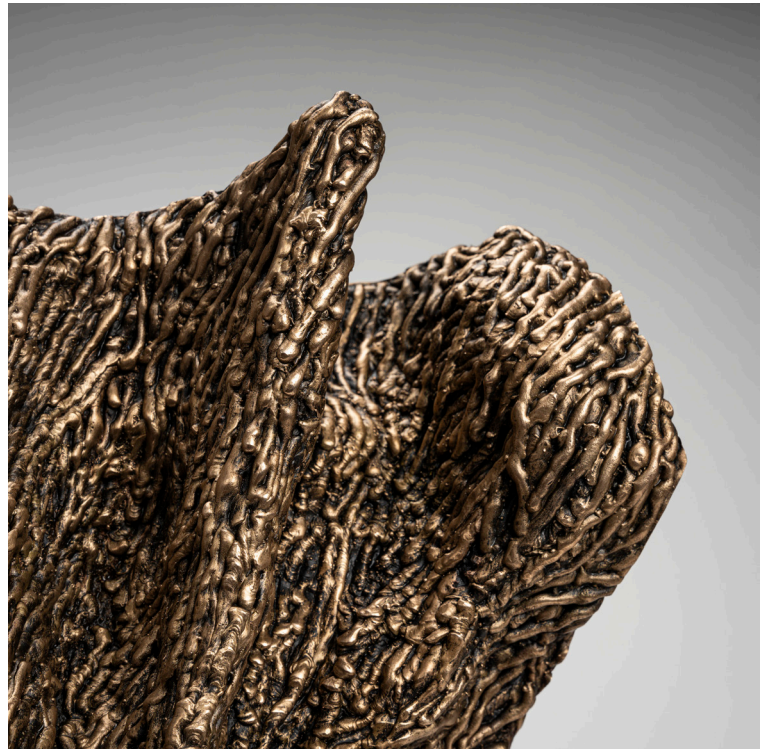
Fragment No. 3

Weathering steel, mild steel, silicon bronze. 11.4 x 12.6 x 17.3". 1/1. 2024.