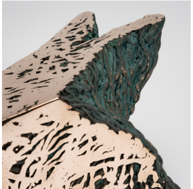
Fragment No. 11 Weathering steel, mild steel, silicon bronze. 15.3 x 7.8 x 8.2". 1/1. 2024.