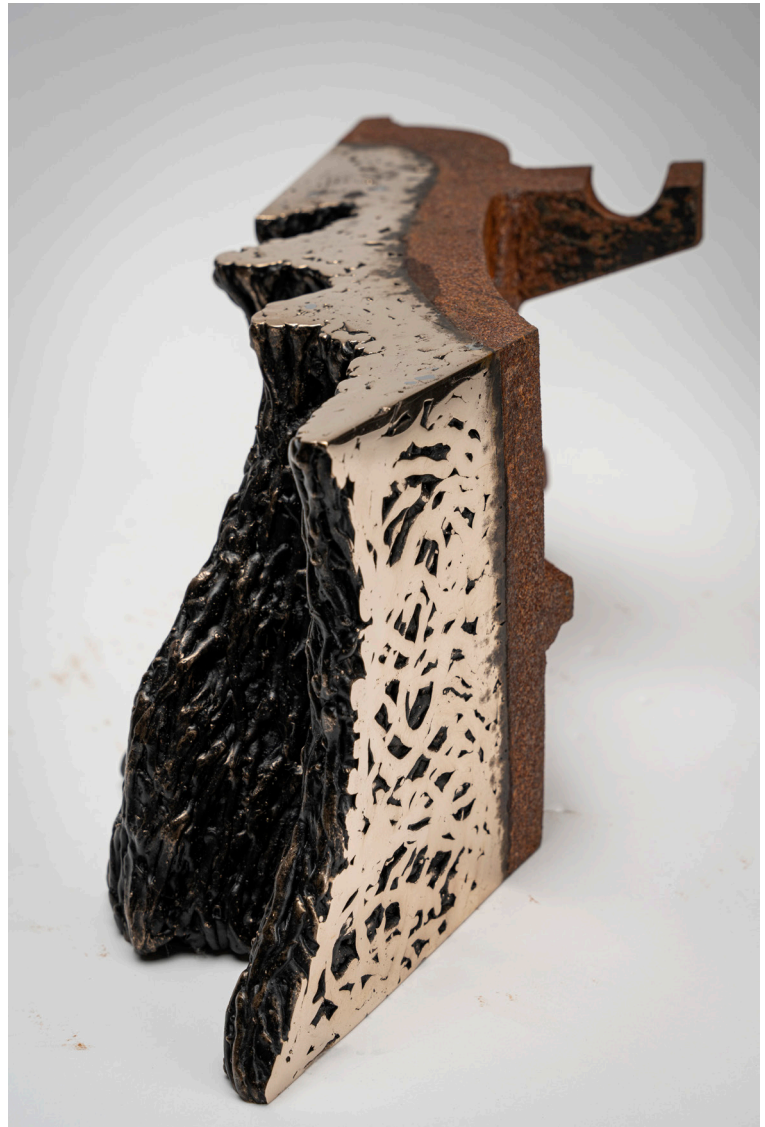
Fragment No. 5 Weathering steel, mild steel, silicon bronze. 14.5 x 6.9 x 6.1". 1/1. 2024.