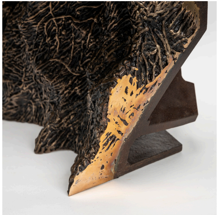
Fragment No. 6 Weathering steel, mild steel, silicon bronze. 14.9 x 19.6 x 25.2". 1/1. 2024.